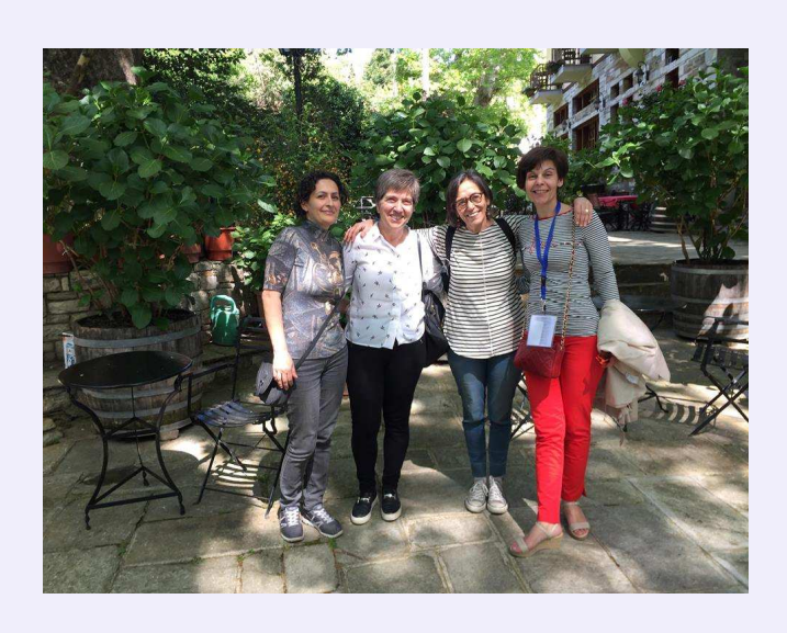
From the excursion to Pelion Village of Portaria